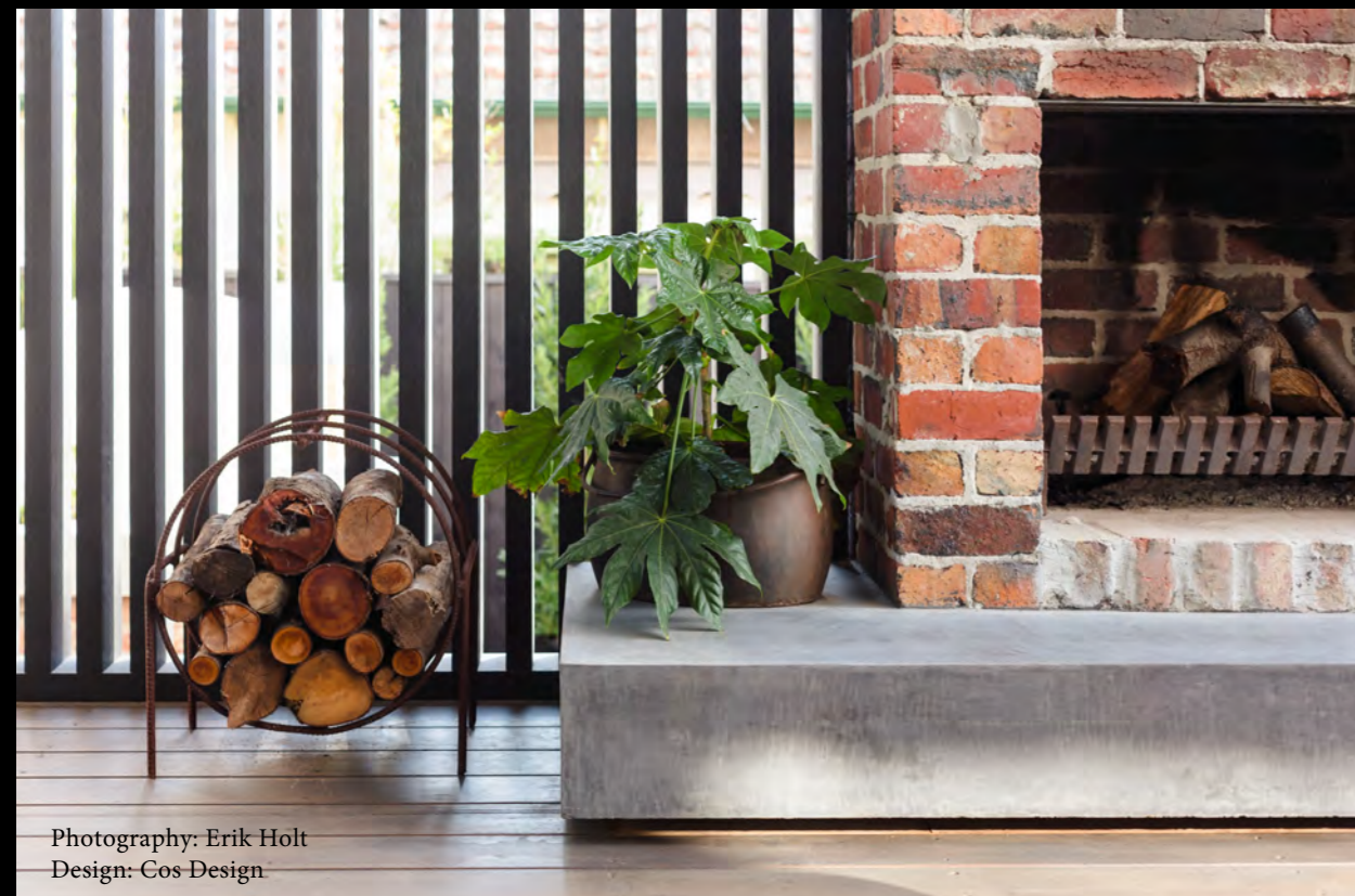
Design: Gos Design

Eco Recyclers Pty Ltd 60 Garden Road Clayton VIC 3168