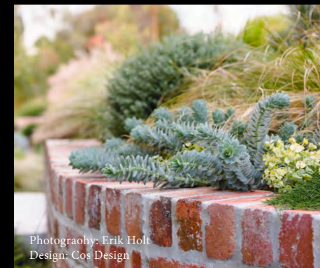
Design: Cos Design