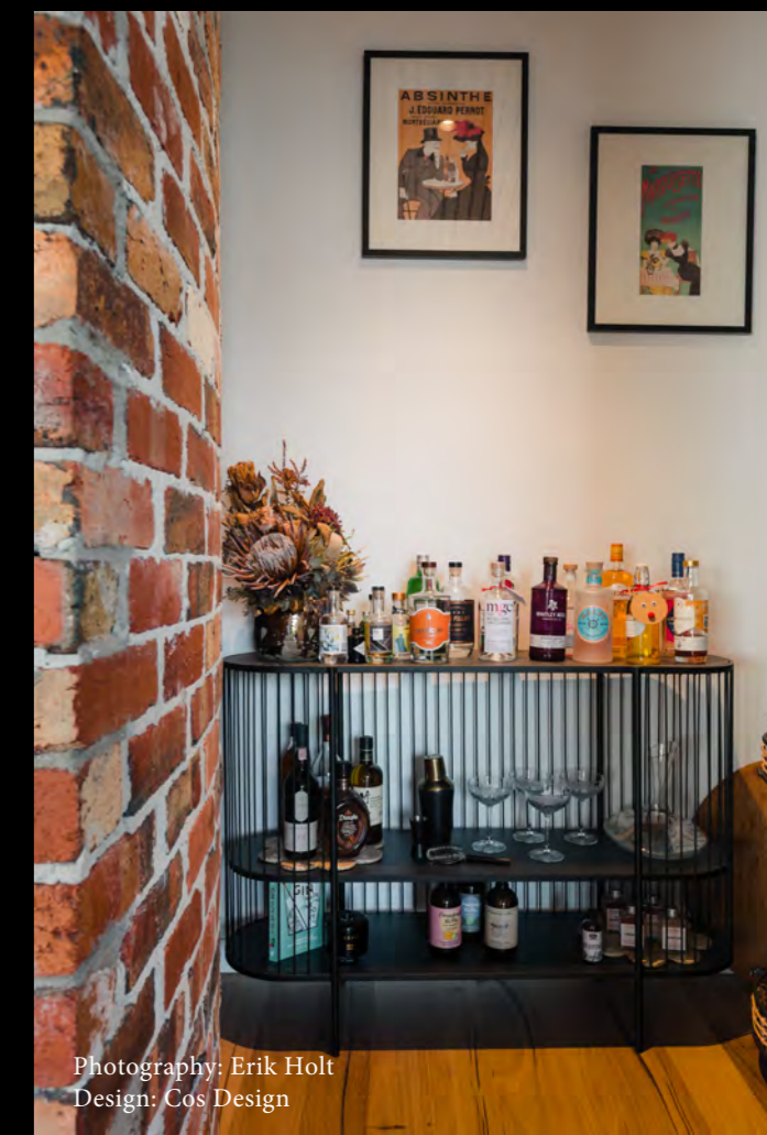
Design: Cos Design