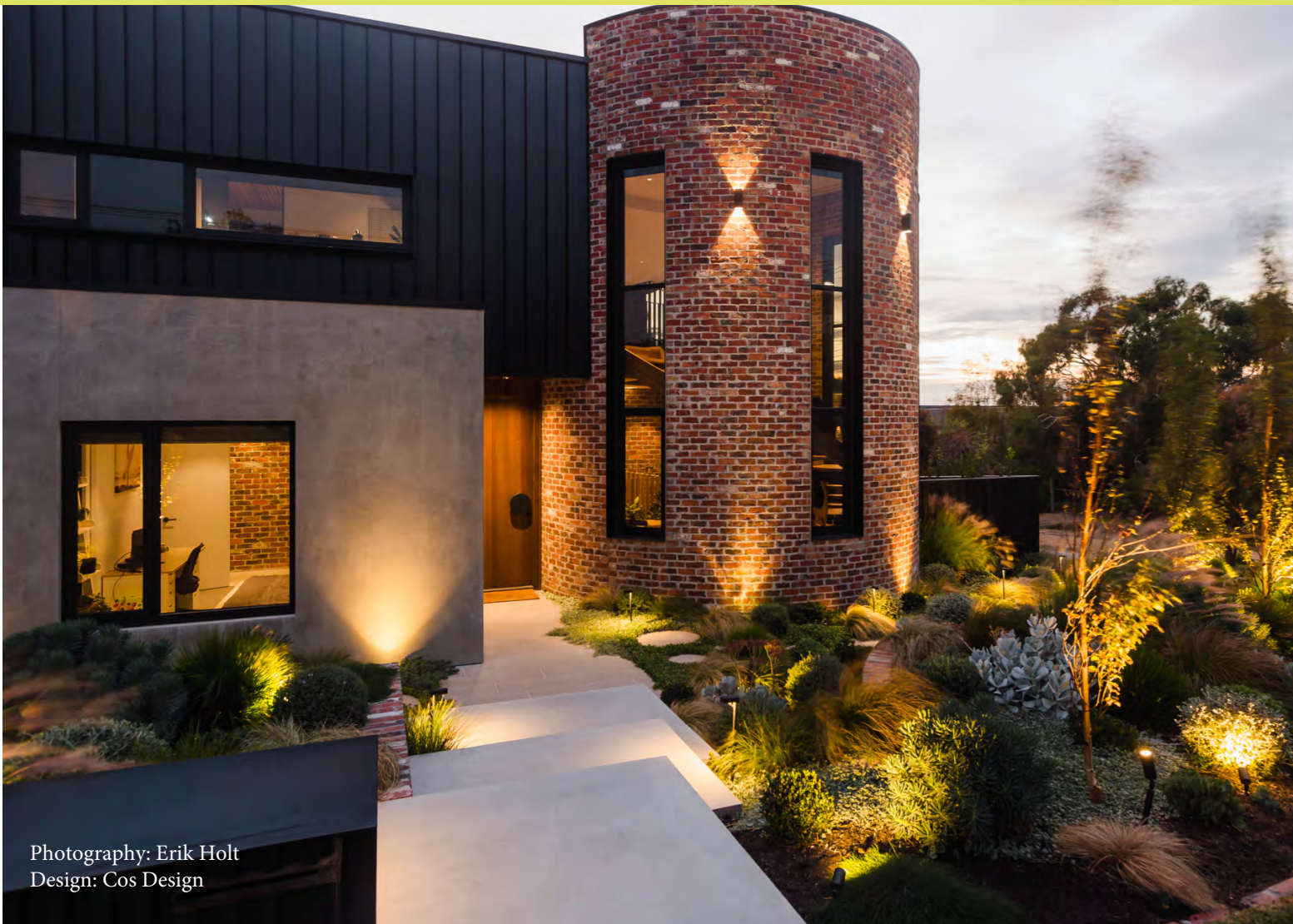
Design: Cos Design

We offer a range of recycled brick products, from builders bricks for rendering to handmade bricks that date back to the late 1800s. Our products are delicately sorted to ensure the products that make the pallet are exactly what is advertised. Bricks that don't make the cut are processed at our brick crushing plant and sold to tennis and baseball clientele for their sporting needs.